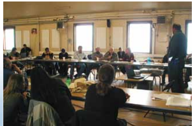
Community meeting at St. Paul.

infrastructure projects have helped create jobs and income, but employment by the City of St. George has dropped sharply and it is unlikely that capital projects will continue indefinitely. Fish processing and ecotourism offer some promise of sustainable economic activity, but other sources of employment and income are likely to be needed as well. One conclusion from both the data and anecdotal evidence was the importance of economic diversification to the long-term health of both communities. Finally, the research showed that while similarities exist between the two communities, they are certainly not identical and changes or perceived changes may impact them differently.