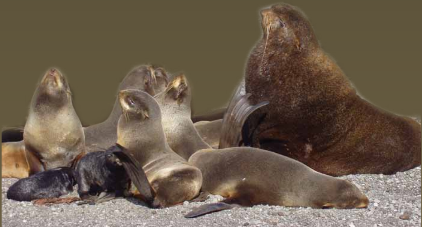
Northern fur seals at St. George Island.