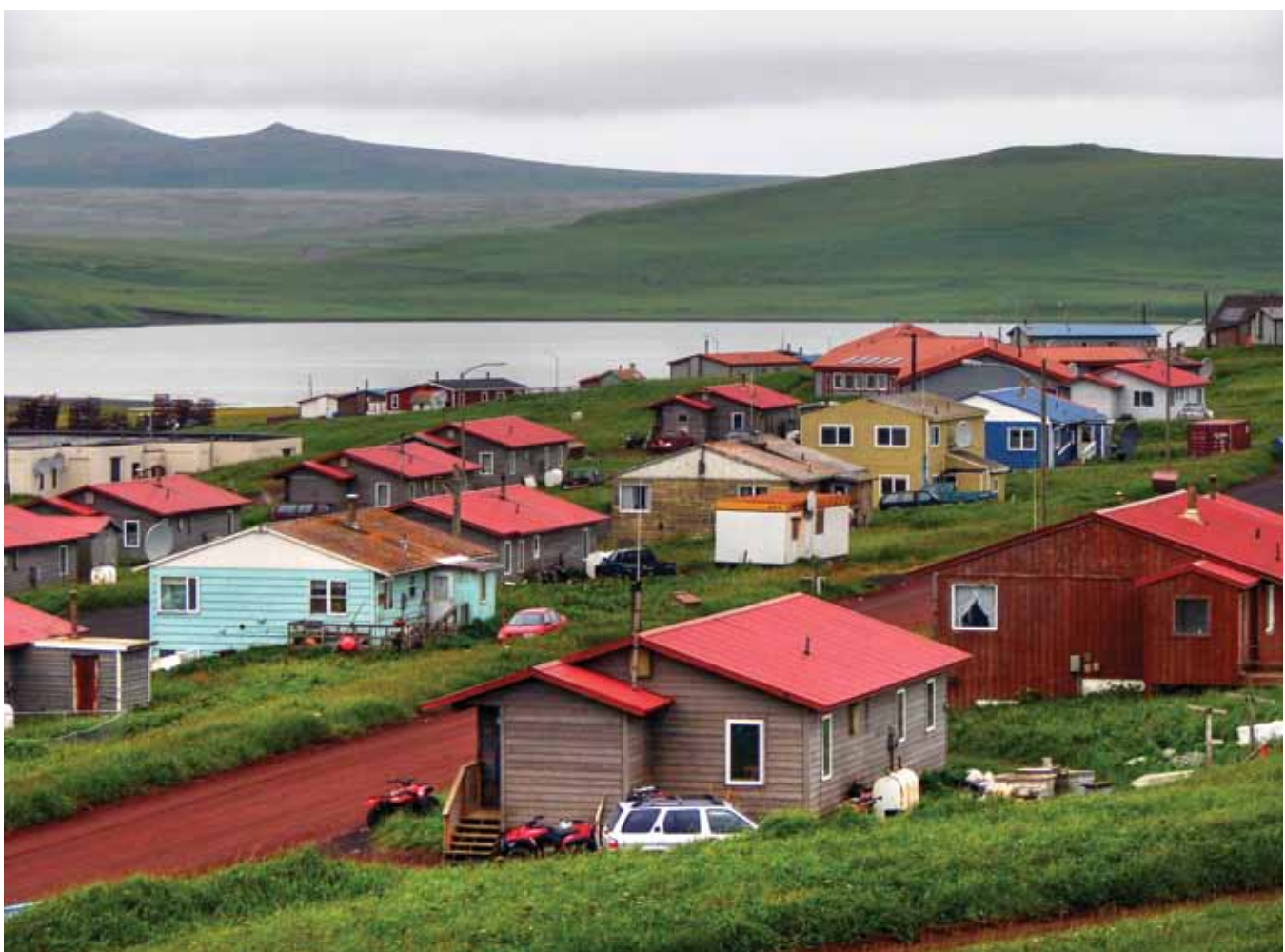
St. Paul in the Pribilof Islands in the Bering Sea.