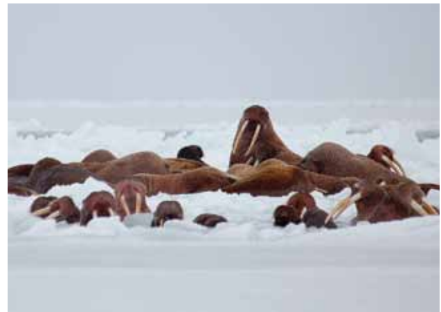
Walrus on ice pack.