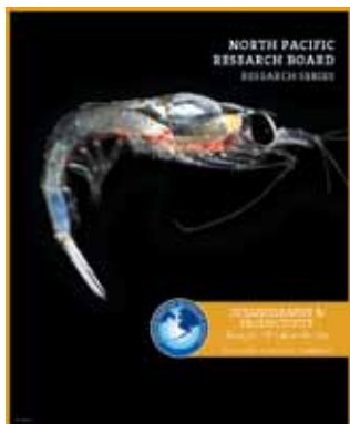
OCEANOGRAPHY & PRODUCTIVITY

Humans is one in a series of publications produced by the North Pacific Research Board in support the 2005 Science Plan developed with guidance from the National Research Council of the U.S. National Academies of Sciences.