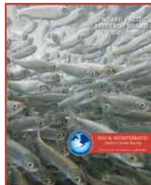
FISH & INVERTEBRATES