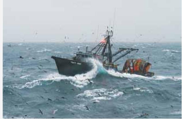
At-Sea Processors Association

Comprehensive rationalization of the fisheries off Alaska and the introduction of rights-based management starting in the mid-1990s were highly contentious issues. A major justification for managing the sablefish and halibut longline fisheries with individual fishing quotas (IFQs) was that it would stop the race for fish and significantly improve the safety of fishing operations. Fishing vessels would be in a better position to pick the right weather to take their catch and would not have to be in the middle of a frenzied fishing opener when a storm struck.