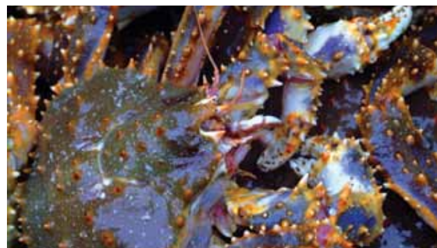
Pribilof blue king crab, caught by F/V Aleutian Beauty for Alaska King Crab Research and Rehabilitation Program, St. Paul Island.

The model demonstrated that the Alaska crab industry faces major competition from Canadian, Russian and Greenland snow crab, and Russian king crab fisheries. Alaska crab revenues have been severely impacted by dramatic increases in snow crab from Canada and the recent emergence of Greenland and Russia as major crab producers has further dragged down Alaska crab prices and revenues.