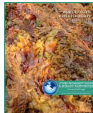
OTHER PROMINENT ISSUES & RESEARCH PARTNERSHIPS

Find out more by visiting our website at nprb.org