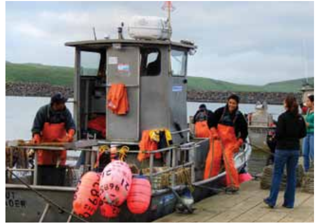
Community fishing at St. Paul Island

PROJECTS 318 AND 640 BOTH FOCUSED ON SOCIAL and economic information that demonstrates the engagement and dependence on fisheries resources of Unalaska, Akutan, King Cove, Kodiak, Adak, Sand Point, and St. Paul and St. George on the Pribilof Islands. The studies described the harvesting and processing sectors in each community as well as support services. Data included numbers and size of fishing vessels, numbers of permit holders by fishery, catch and earnings data, crewmember information, quantitative assessment of processing activities, and estimates of the importance of fishery-related revenue to the municipal revenue for each community. For example, fishery-related revenues accounted for 41-47% of total revenues for Unalaska, and 52% for Kodiak, suggesting that managers must heavily weigh impacts of changes in fishing regulations on these communities.