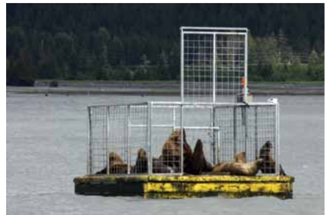
Gulf of Alaska: Graves Rock. Sea Lions and Fairweather Range: Summer 1999.