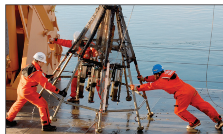
Deploying a multi-corer.